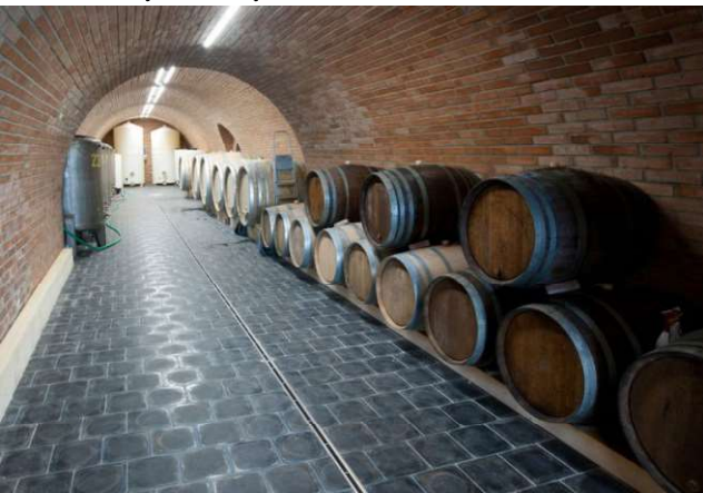
Smooth tiles, wine cellar in South Moravia