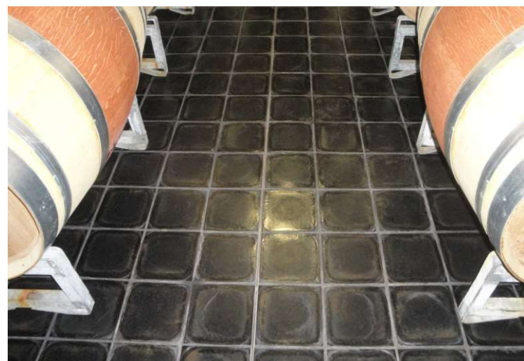
Wine cellar in Italy