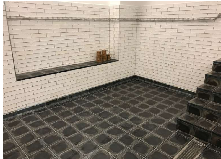
Tiles 250x250 mm – floor and stairs