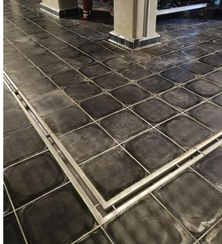
Tiled columns, floor drainage, winery in Italy