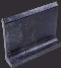
L-piece (plinth tile)