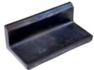
L-piece (plinth tile)

Smooth-faced plain tiles are produced in sizes of 200mm x 200mm or 250mm x 250 mm with a thickness of 22mm or 30mm. Where required, anti-slip tiles are also available in sizes 200mm x 200mm or 250mm x 250mm with a thickness of 30 mm, type B, C or D. For floor-to-wall junctions, we recommend using L-shaped plinth tiles with a corner radius for easier cleaning and maintenance. Plinth tiles are available in lengths of 200mm or 250mm, with different heights and thicknesses dependent on the floor design. We can also create custom-made shaped pieces for lining internal and external corners.