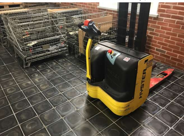
Baloun winery in Velké Pavlovice