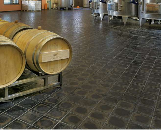
Winery floor, Italy