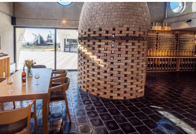
Floor tiles in the Vinárstvo Premium Vráble, Slovakia